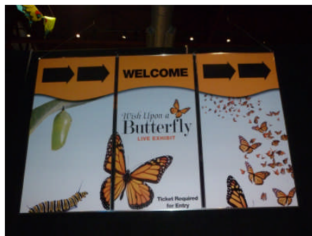
Butterfly exhibit at Michigan Science Center