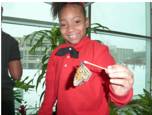
Above: Nolan Elementary student scientist learning about butterfly habitat and conservation at the Michigan Science Center.

The science, technology, engineering and mathematics (STEM) revolution is moving at lightning speed. Decisions regarding product innovation, human resource alignment and the flow of capital investment are being made within hours rather than in days or months. If this is what living in the 21 st century is going to be like, then having a solid understanding of scientific concepts and the ability to perpetually apply them is no longer optional, it is required.