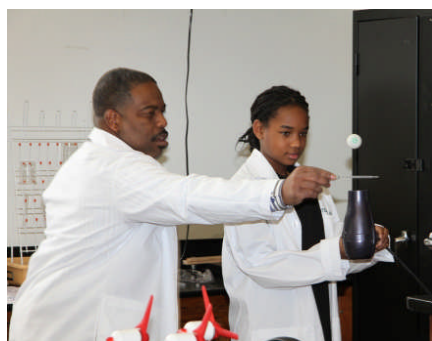
Nolan student scientist conducting experiment to demonstrate Bernoulli's Principle